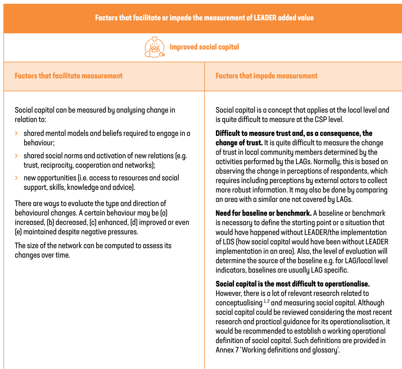
Table 3. Factors that facilitate or impede the measurement of LEADER added value

The table below presents a list of factors that facilitate or impede the measurement of the different elements of each of the LEADER added value components.